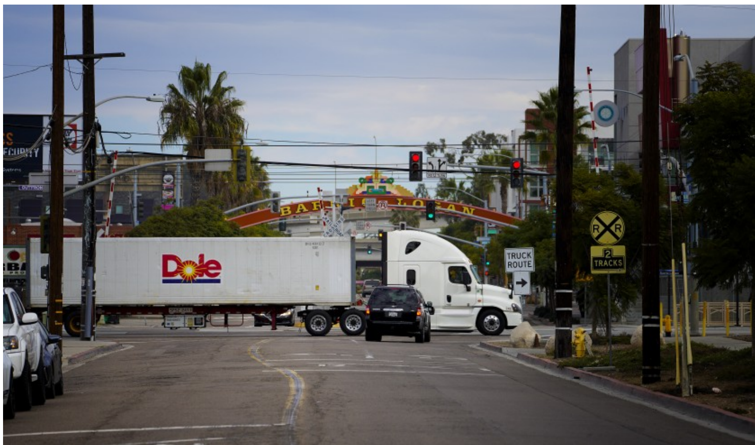
Large semi trucks hauling goods, drive along Harbor Drive and Cesar E. Chavez Parkway in Barrio Logan on Tuesday, Dec. 8, 2020 in San Diego, CA.

According to the environmental impact report, when in operation, Mitsubishi should use one or more zero-emission trucks to evaluate the “capability” of such trucks to transport cement.