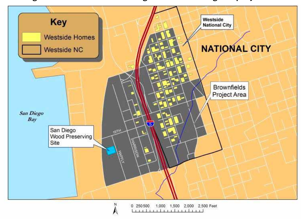
Figure 1: Location of the San Diego Wood Preserving Company Site

2010 Haffley Avenue (Figure 1). The GIAP will incorporate a number of green and sustainable features to minimize or mitigate water and energy use, reduce storm water runoff, recycle waste products, and reduce air emissions.