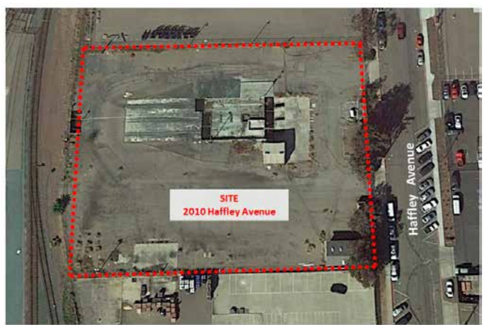
2010 Haffley Avenue Aerial

in 2007. Since 2007, the site has been unoccupied, though many SDWPC operational features and facilities are still present, including a woodpreserving process facility of approximately 3,000 square feet. Former SDWPC operations have been removed from the site.75