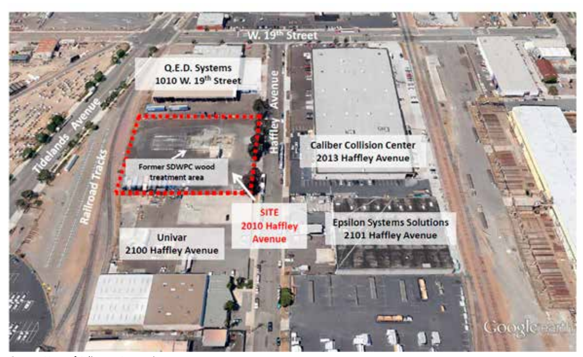
Current Uses of Adjacent Properties