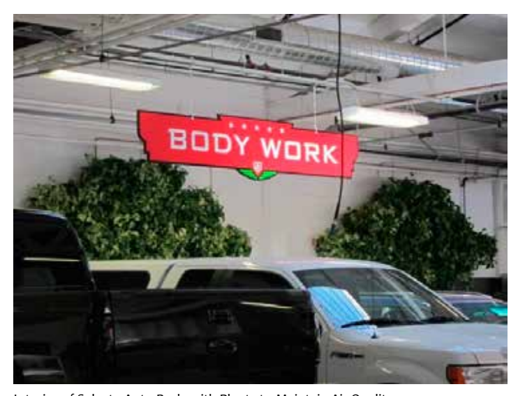
Interior of Selecta Auto Body with Plants to Maintain Air Quality

Selecta Autobody Shop has adopted the following green features and business practices to make its autobody work more eco-friendly and sustainable: