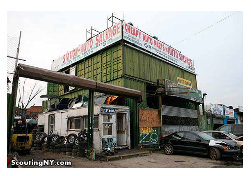
Exterior of Shop Made of Shipping Container