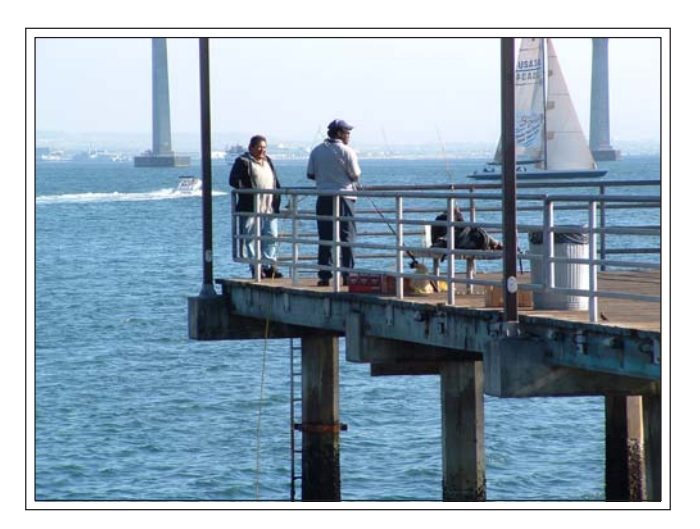
Be sure to go to our website to sign and mail our postcard to show your support for a Clean Bay

Visit our website at <u>www.environmentalhealth.org</u> to keep informed about the date of the hearing. Also sign up to receive our email Action Alerts and regular updates on issues of your interest.