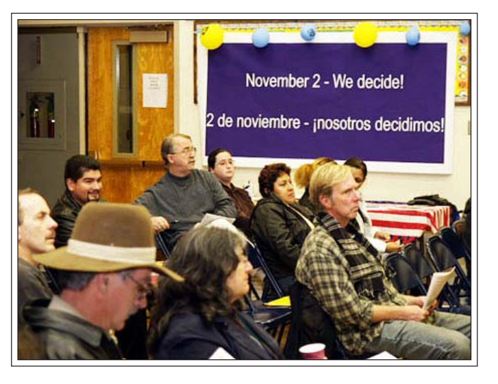
EHC's Voter Forum on the propositions. Part of our Voter Education effort.

Our resolve to win justice isn't shaken and our resolve to be smarter and more effective is strengthened.