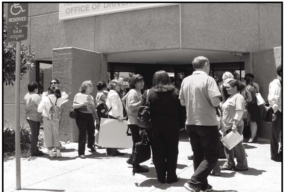
Outside the offices of the Regional Board, supporters gather before the June 29th hearing