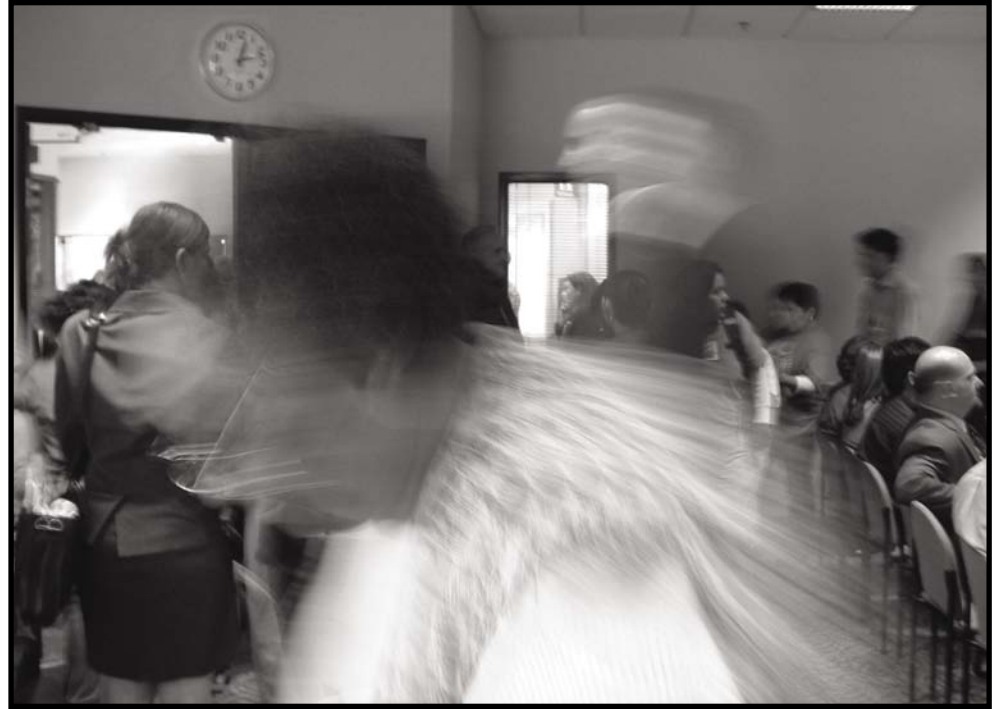
Supporters as they walk out of the Regional Board chambers, boycotting the scheduled workshop

The intent of the Regional Board appears to be clear: The board will adopt a clean up order and the shipyards will clean up the contaminated sediments. The Board staff has proposed a rigorous set of procedures for a hearing process that can be expected to take several months to complete. EHC supports these continued