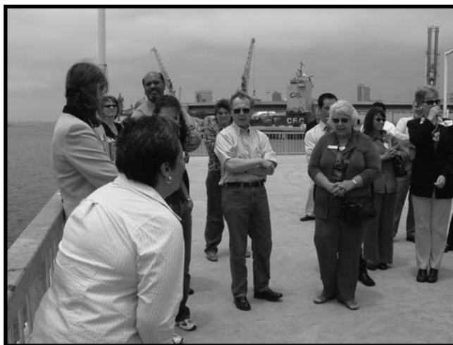
Secretary Lloyd and CalEPA representatives at a pier in San Diego Bay. The Bay has been characterized as one of the most polluted in the nation

The key issues discussed during the tour are illustrated on the map in the center of this issue of the Toxinformer.