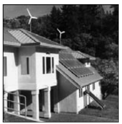
...a solar panel on every roof in San Diego, dual panes in every window.