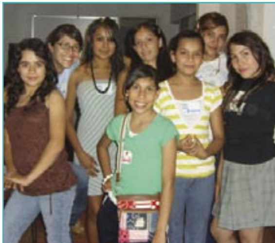
Chilpancingo Youth Group Grupo de Jóvenes de Chilpancingo