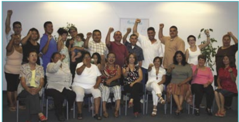
Graduation from Barrio Logan and National City Land Use Training