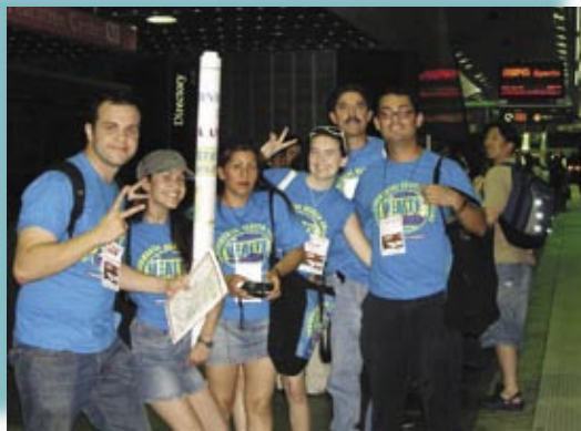
EHC Staff, Apprentices and CAT leaders at U.S. Social Forum in Atlanta. Personal, Aprendices y Líderes del CAT de EHC en el Foro Social Estadounidense en Atlanta.