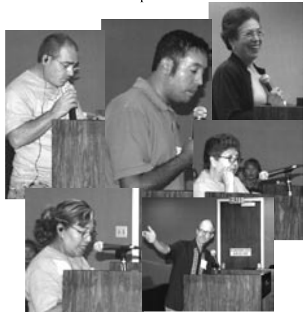
Residents testify in support of EHC core demands

Many developers called for additional unrestricted height allowances throughout the neighborhood to maximize profits, though this was rejected by the Council. Developers also called for the plan's redesign, but the Mayor and Councilmembers rejected these delays. The next step, a thorough environmental review, is to be completed the summer of 2008.