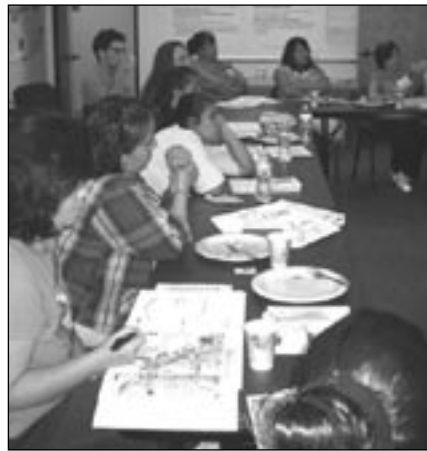
SALTA Participants Discuss Plan Options

During the summer of 2007, as the City prepared to select the stakeholders group and a team of