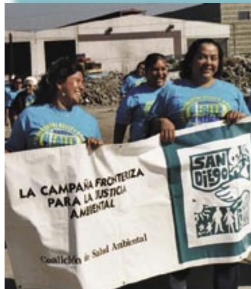
Colectivo Members rejoice as Metales y Derivados cleanup begins. Miembros del Colectivo se alegran mientras inicia la limpieza de Metales y Derivados.