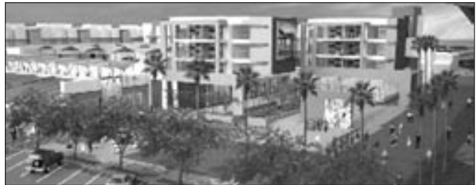
Shea Properties Mercado Project Design

The other developer, McCormack Baron Salazar, proposed a more complicated mix of affordable and market-rate housing and a larger scale, more costly project. Accord-