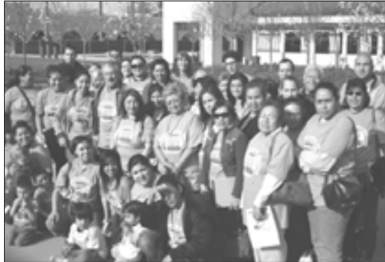
EHC gathers at the Chula Vista City Hall to support the Climate Change recommendations.

the city will make good on their promise to the community to reduce greenhouse gases in compliance with their Carbon Reduction Plan,” stated