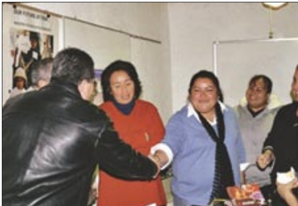
Colectivo Chilpancingo Pro Justicia Ambiental members meet with Baja California state officials after a meeting of the Metales y Derivados Working Group.

Capacitación de jóvenes, en la oficina del Colectivo, sobre los peligros del plomo en los dulces.