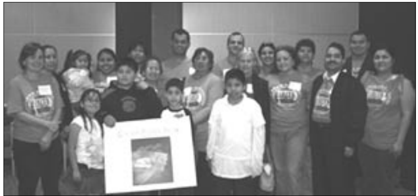
Community members and EHC staff turn out to demand community protection at a March hearing for the Clean Air Plan.