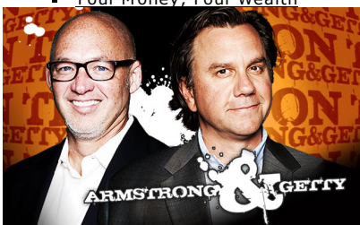
Listen to Armstrong & Getty Weekdays 6am - 9am