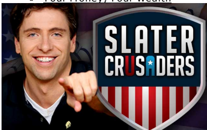
Are you a Slater Crusader?