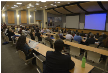
Imperial Valley Press

Posted: Saturday, November 2, 2013 11:55 pm