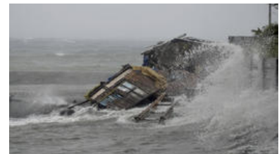
Super Typhoon Batters Philippines

Said Councilman Kevin Faulconer, a top mayoral contender who was outvoted along with three colleagues in a 5-4 Council tally on the new Barrio community plan rules: "I am urging my council colleagues to listen to these 50,000 San Diegans that have signed this petition. I urge them to join me in rescinding this community plan to threatens thousands of jobs, so we can bring all sides back to the table and work toward a real solution..."