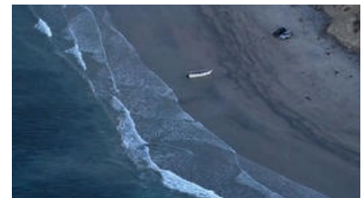
Tunnel Discovery Likely to Push Smugglers to the Sea: Agents