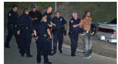
Officers Tase Driver at Hit and Run Crash