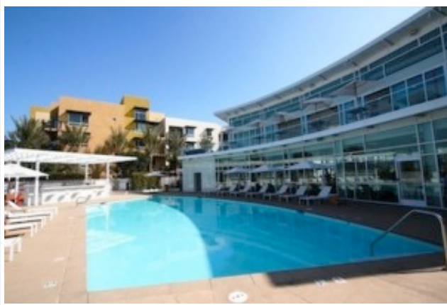
( http://www.sandiegometro.com/wp-content/uploads/2013/11/Domain-San-Diego.jpg ) Domain San Diego

a master-planned community. It is Wood Partners' first multifamily development acquisition in San Diego County.