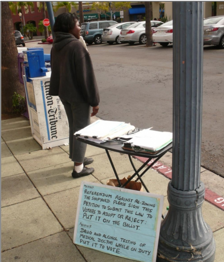
A signature gatherer outside of Trader Joe's in Hilcrest displays a sign falsely stating that a referendum would prevent "re-zoning the shipyard."