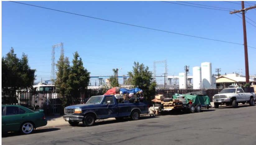
Barrio Logan's community plan would restrict industrial and residential use in this block in a planned buffer zone. - Roger Showley