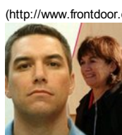
Mother Of Twisted Killer Scott Peterson Dies... WITHOUT...