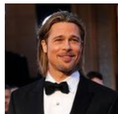
Tour Brad Pitt's Malibu Home for Sale FrontDoor