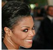
Summer Hairstyles : 15 Fly Star Looks To Beat The Heat MommyNoire