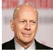
Tour Bruce Willis' Idaho Home for Sale HGTV FrontDoor

( http://mommynoire.com/83484/celeb-summer-hairs ( http://www.frontdoor.com/photos/tour-bruce-willis-i-sale )