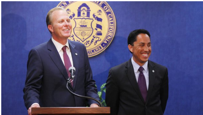
Mayor Kevin Faulconer and City Council President Todd Gloria.

(http://www.utsandiego.com/newsletter/signup/)