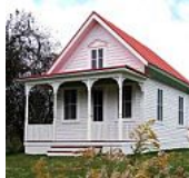
Tear Down the McMansion, All Hail the

( http://mommynoire.com/83484/celeb-summer-hairs ( http://www.frontdoor.com/photos/tour-bruce-willis-i-sale )