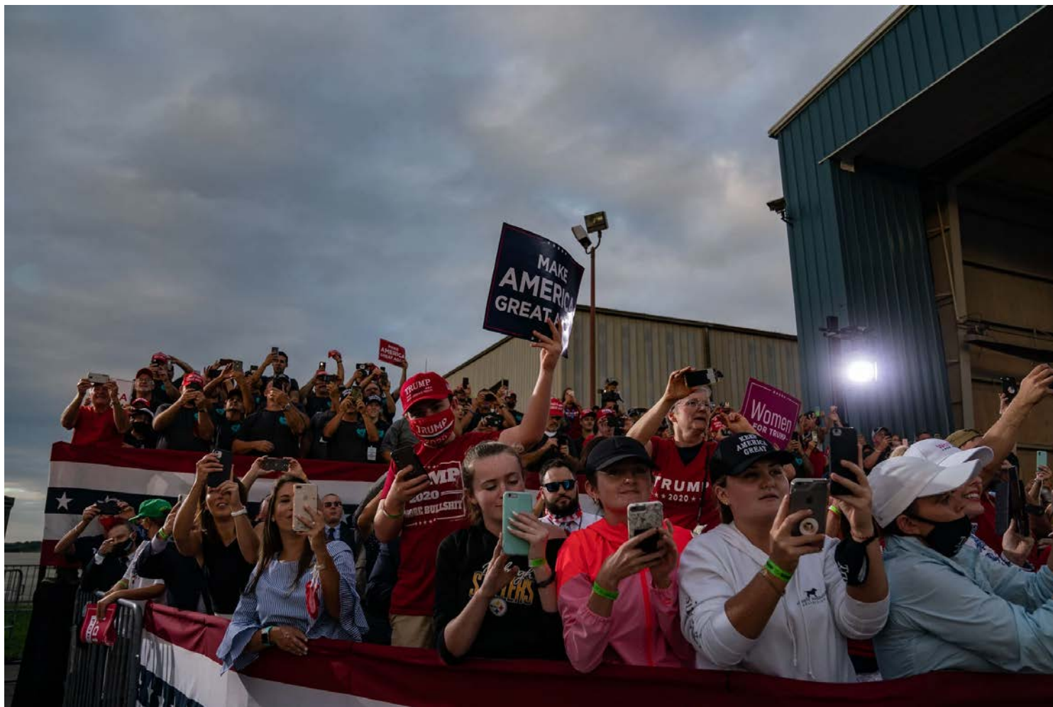
President Trump has continued to hold larger, more traditional campaign events. Mask use is rare and social distancing non-existent.