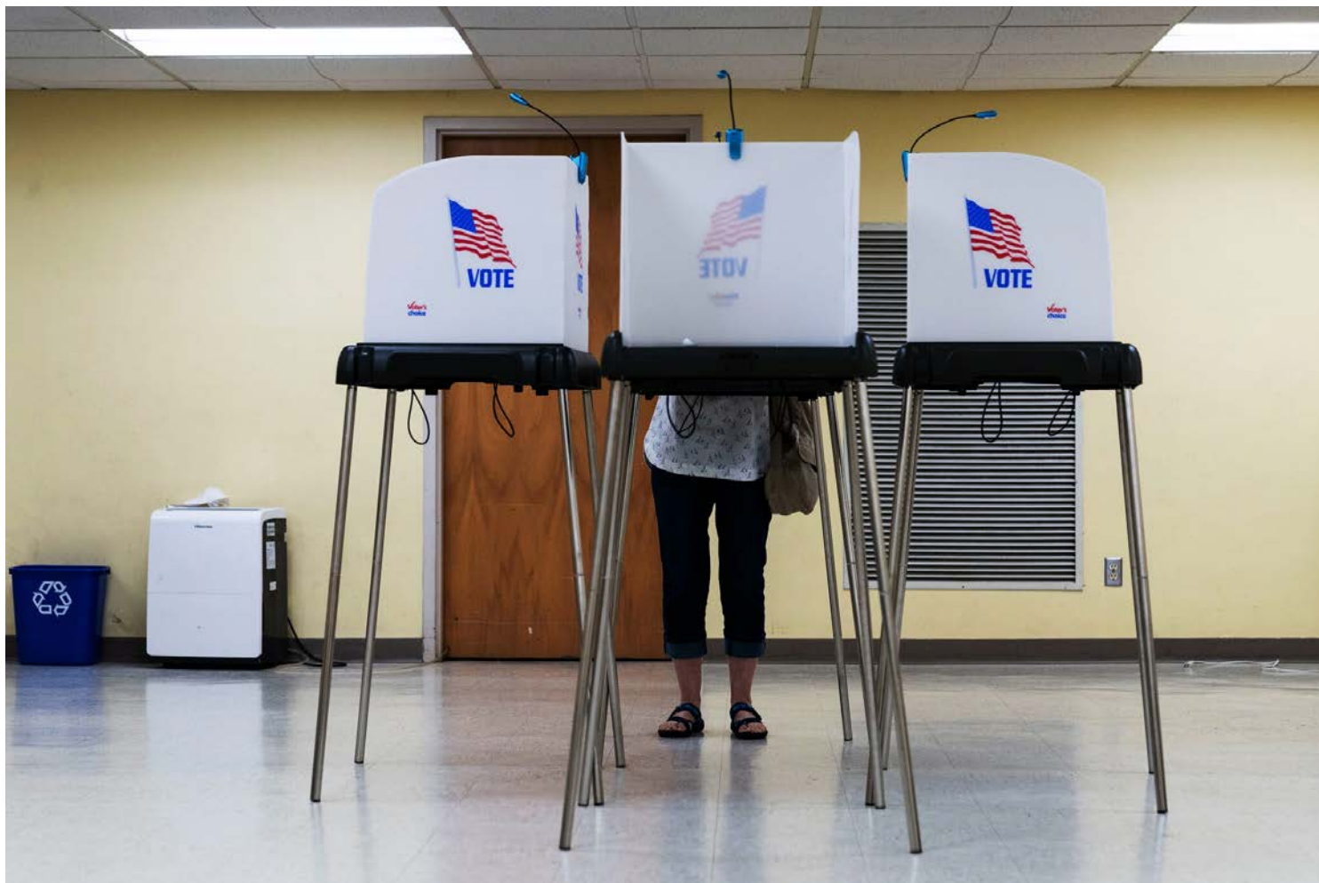
Whether and how the people closest to you vote plays a huge role in your own decisions.

Conversations with nearly a dozen thinkers from the worlds of political science, political psychology, technology, organizing and campaigning suggest that we are ill-designed for the pandemic election. The internet, many said, is centrifugal, driving people away from each other and toward only close friends, immediate family and themselves — the opposite of the centripetal force that elections and their aftermaths demand, and that physical interactions often provide.