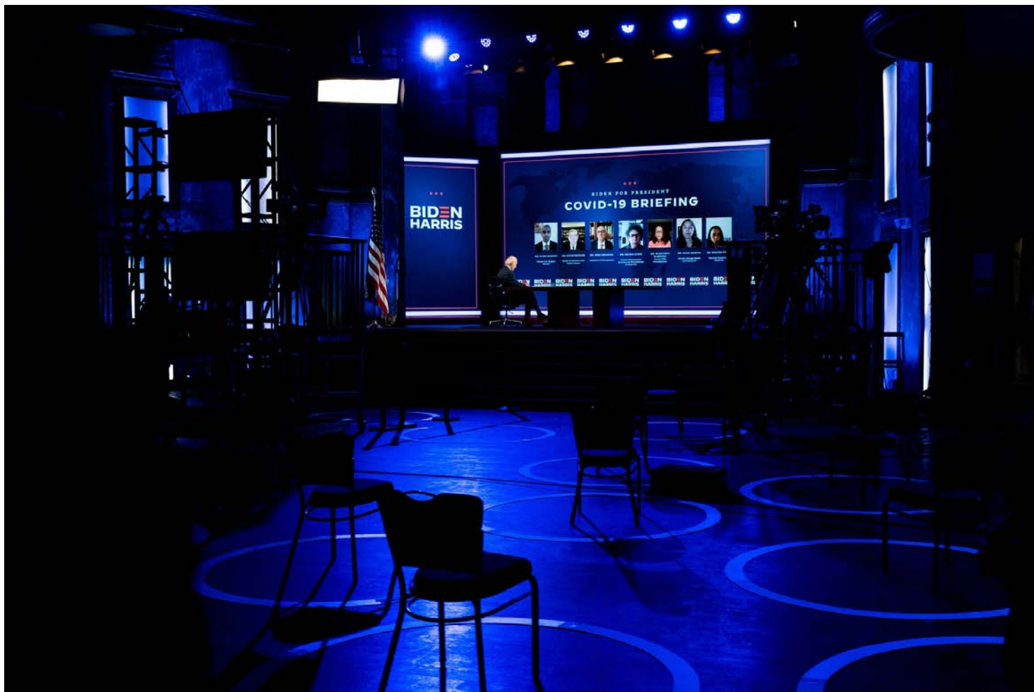
Joseph R. Biden Jr., the Democratic presidential nominee, has conducted many events virtually since the virus struck.

“But you are often subject to crosscutting pressures, as we call it, by surprise,” she continued. “You’re at the grocery store, your kids’ soccer games. These are important ways people are exposed to ideas with which they disagree.”