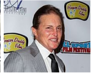
The Family Finally Weighs In on Bruce Jenner's News Stirring Daily