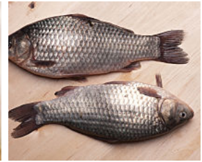
NEVER Eat This Type of Fish (Ever) The Inflammation Solution