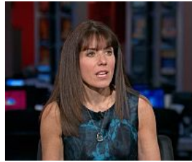
Watch "Getting Couples to Talk Finance" Video AARP