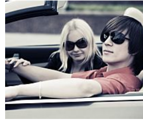
16 Fun-To-Drive Cars Capable Of 40 MPG MPGomatic