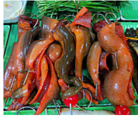
Top 10 Cancer Causing Foods You Eat Every Day NaturalON