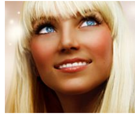
Is This What's Putting Tanning Salons Out Of Business? Tan Physics