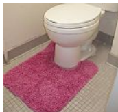
Do You Make These Decorating Mistakes? How NOT to Decorate HGTV

( http://www.hgtv.com/decorating-basics/25-biggest-decorating-mistakes/picture )