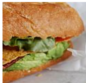
San Diego's 9 Best Sandwiches Zacat

( http://styleblazer.com/283941/15-celebs-show-too )