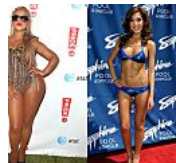
25 Celebrities Who Show Too Much On Red Carpet Styleblazer

( http://www.hgtv.com/decorating-basics/25-biggest-decorating-mistakes/picture )