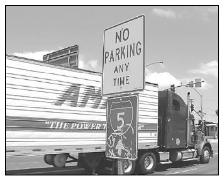
The first step to reducing diesel pollution in Barrio Logan has been accomplished -- reducing truck idling and parking on residential streets.