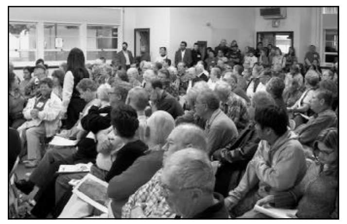
Make your voice heard -- public participation makes a difference. The fervor of the standing-room-only crowd who attended the first public workshop on the bayfront development set into motion this new round of planning.

Contact Nohelia at (619) 235-0281 or email <u>NoheliaR@environmentalhealth.org</u>. For updates on the planning process, visit www.environmentalhealth.org