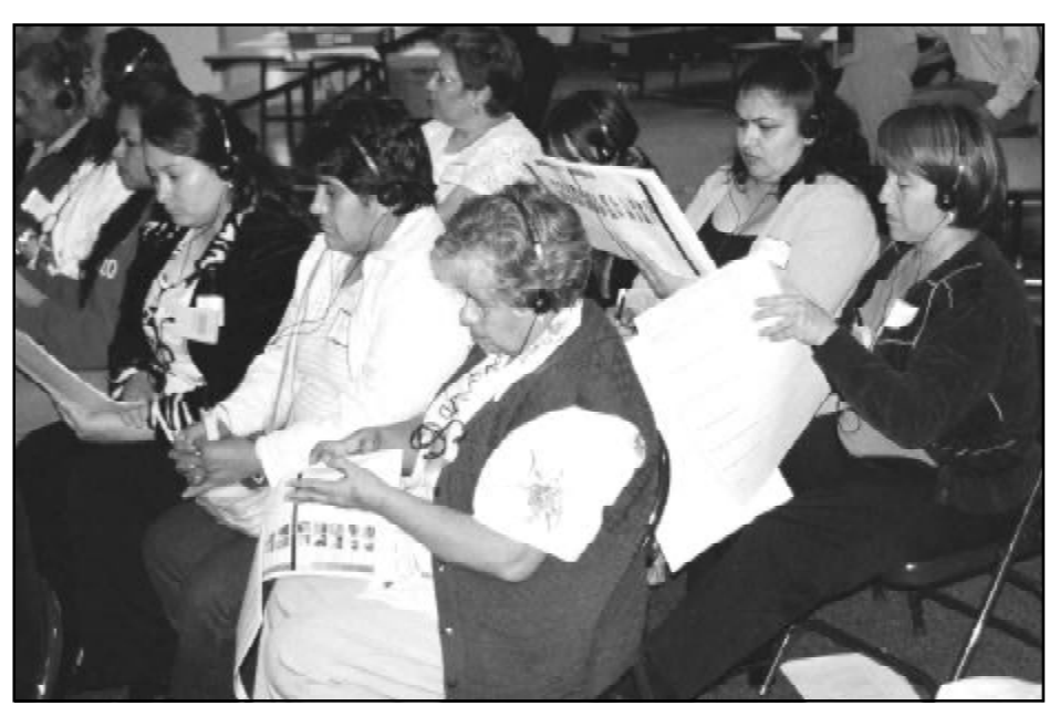
Barrio Logan residents review several planning options before breaking out into small group discussions. Eliminating mixed-industrial zoning and diesel pollution while preserving the culture and affordability of the Barrio were top priorities.

EHC has worked in the Barrio Logan community since the mid-1980s, empowering residents to work together to solve the community's environmental justice problems. In