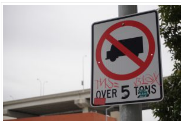
Signs like the one above were installed on streets that the resolution deemed "prohibited."

In 2005, the San Diego City Council approved a resolution that aimed to prohibit commercial vehicles of five or more tons to use certain streets in Barrio Logan. Signs were also installed on streets as a result of the resolution.