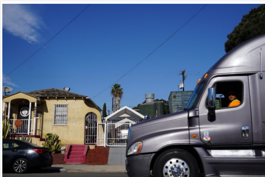
A semitrailer going down Boston Avenue on Dec. 14, 2017.