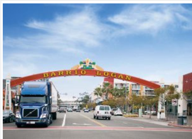
A semitrailer driving down one of the prohibited streets in Barrio Logan. Sign on right indicates no trucks over five tons are allowed.